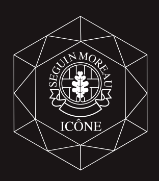
"Inspired by the past, built for the future"

For personalized advice, contact them at: info@seguinmoreau.com